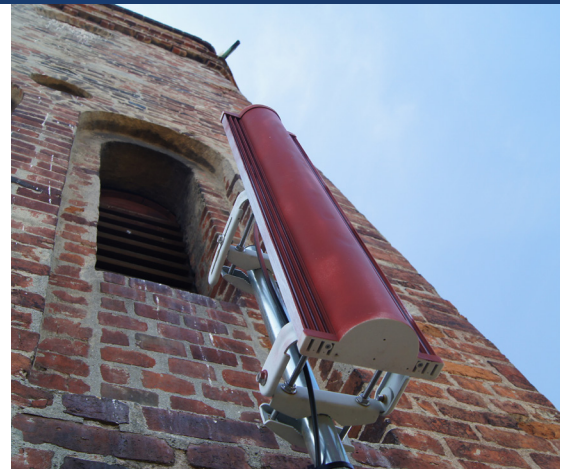
ePMP Access Point