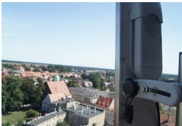
ePMP Access Point connect the city